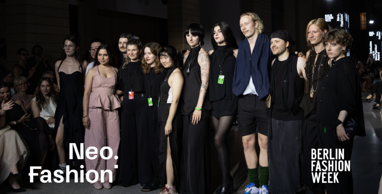
Best Graduates on the runway.

Press Release Neo.Fashion. presented by Potsdamer Platz during Berlin Fashion Week: